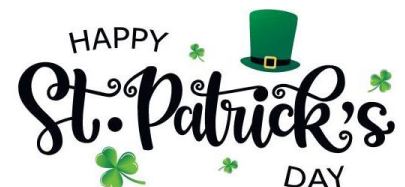
N Coughlan Principal